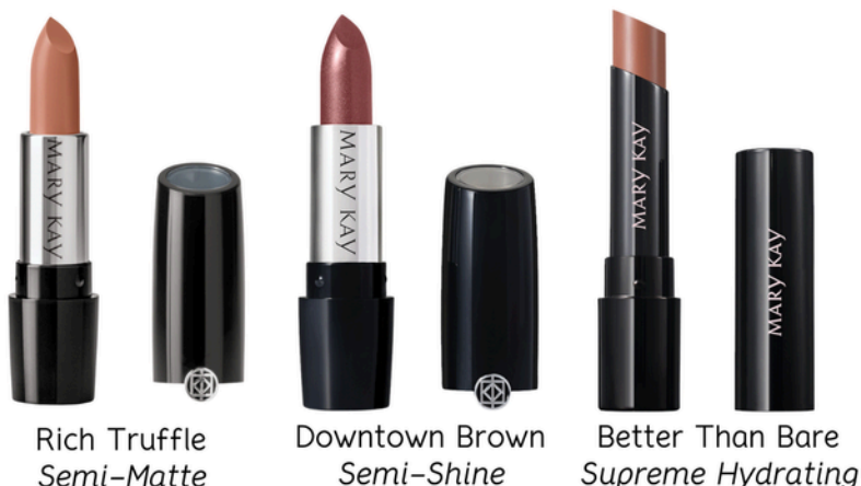
Rich Truffle Semi-Matte

Feel confident with one of our gorgeous lip stick formulas.